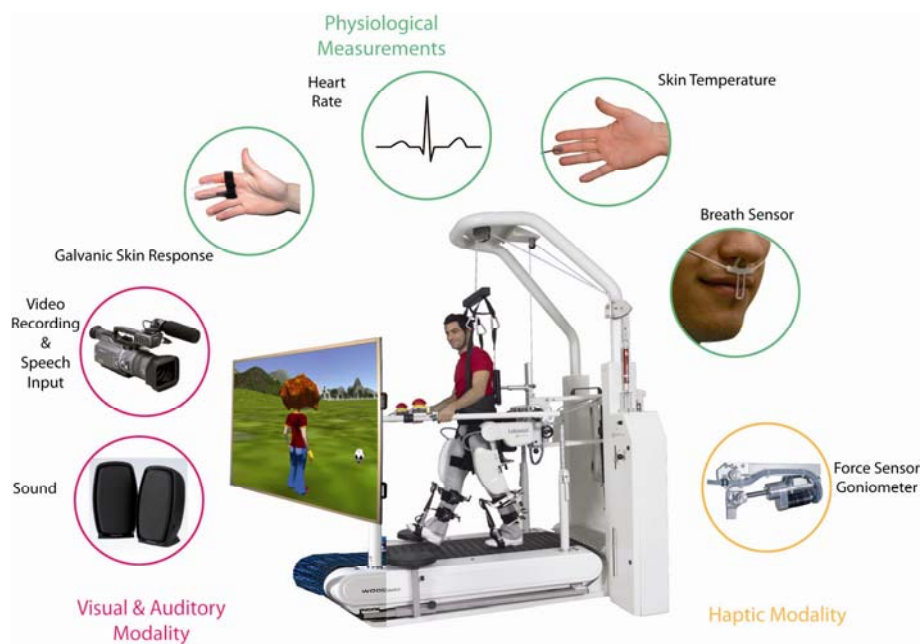
Figure 2: Downscaled Lokomat set-up