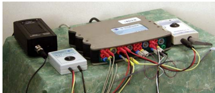
Figure 4: Psychophysiological measurement systems

Signals obtained from the sensors are amplified and converted to digital form using the g.USBamp biosignal amplifier (Guger Technologies, Graz, Austria). The amplifier can sample sixteen signals simultaneously with an input range of +/- 250 mV and allows up to four independent ground inputs. It can be connected to a PC using a simple USB cable.