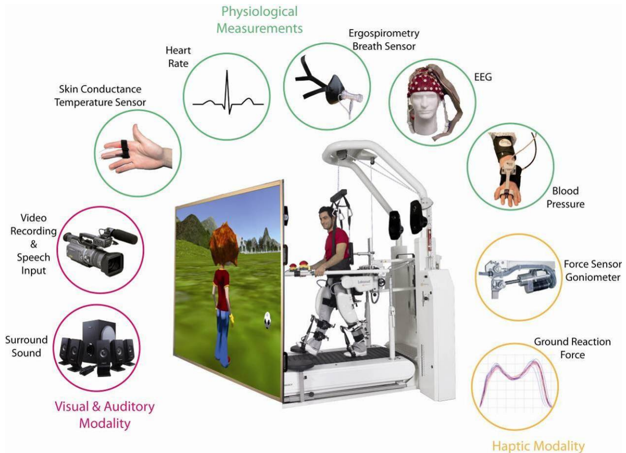
Figure 1: Maximum configuration set-up for Lokomat

The maximal configuration setup (cf. Deliverables D1.2 and D3.1) was reduced to the first downscaled platform based on the evaluation of all possible psycho-physiological measurement sensors (cf. Deliverables D1.2 and D3.1).